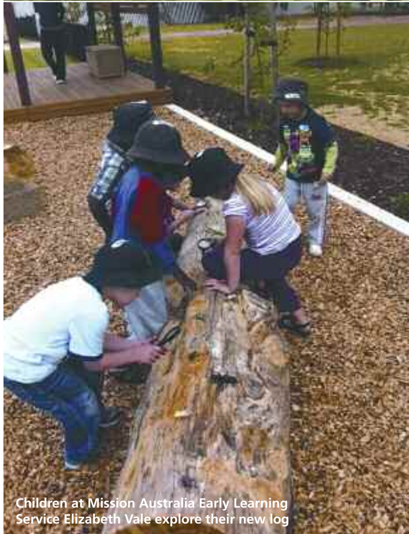
Children at Mission Australia Early Learning Service Elizabeth Vale explore their new log