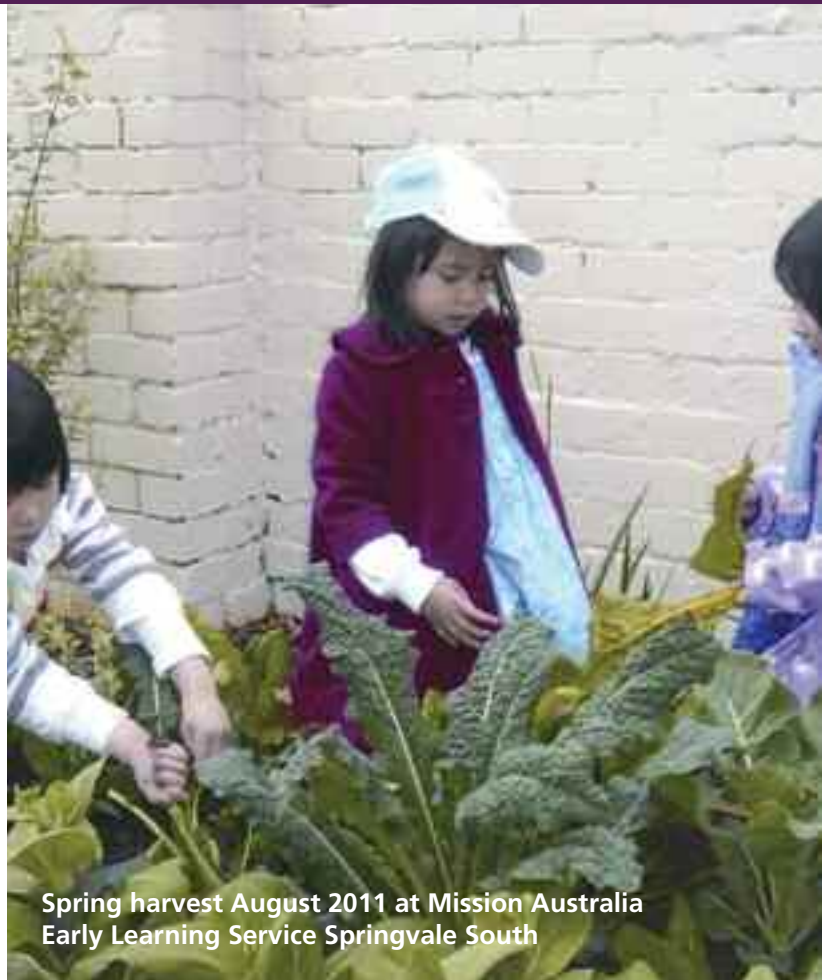
Spring harvest August 2011 at Mission Australia Early Learning Service Springvale South

All of this has been achieved with the fantastic support of the Board of Mission Australia and the whole of the MA team. To have the weight of such an iconic organisation and the financial backing of the Board inspires the early learning team every day. We are well on the way to financial sustainability and the provision of high quality education and care for all of the children in Mission Australia Early Learning Services.