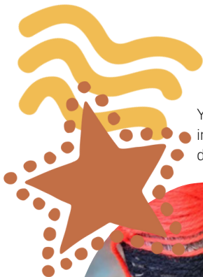
Yarn-bombing by the children in Jacaranda Kindergarten during NRW