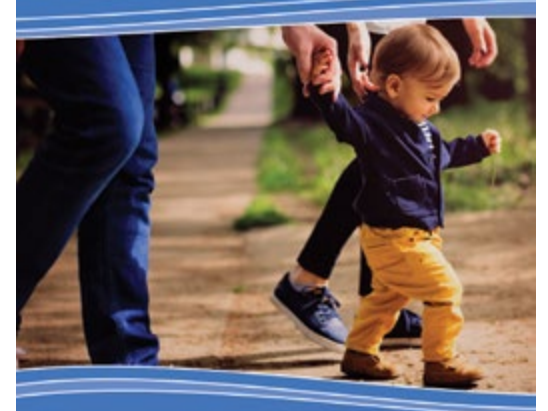
"It's never too late. As we are learning new ways of parenting, good things will hoppen for both us and our children." Circle of Security Parenting